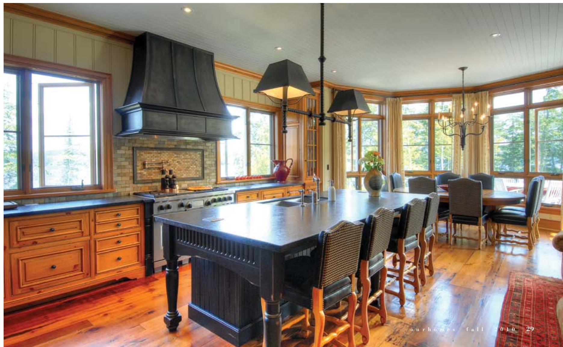
BELOW: The large granite-topped island with its built-in sink provides plenty of room when the Ball family gets cooking. An alcove circling the dining area bathes the room in morning sunlight.