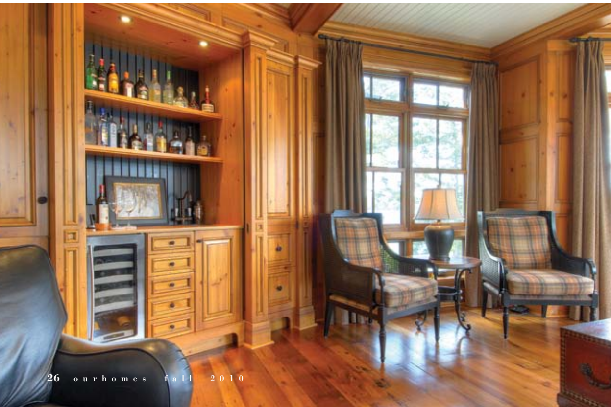
TOP LEFT: Reclaimed wood was used to create some of the home furnishings with an antique look.