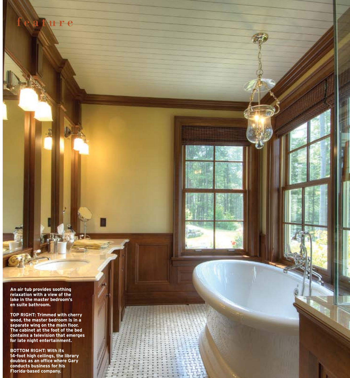
An air tub provides soothing relaxation with a view of the lake in the master bedroom's en suite bathroom.